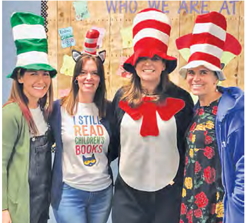
Staff getting in the spirit of celebrating Read Across America Week.

wore red and blue to align with One Fish, Two Fish, Red Fish, Blue Fish, we wore our favorite hats to show our enjoyment of Cat in the Hat, and we got to be silly by wearing our clothes backwards, inside out, or mismatched to show our appreciation of Wacky Wednesday. Silly socks were also worn to go along with Fox in Socks and college shirts were worn to acknowledge our bright futures as we made connections to Oh the Places You'll Go. From guest readers, reading rotations, and readers' theater to book picnic parties, STEAM activities, and art projects, it was a great week to be a Seahawk!