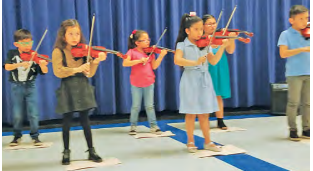
Students stand with poise and pride as they showcase their violin repertoire.

musicians perform in a mid-semester concert showcasing their musical growth. Students play an age-appropriate repertoire that shows off their musical talents to family and friends. Although the program started in January, the weekly classes will prepare these mini musicians for their Finale Concert at Biola University in May.