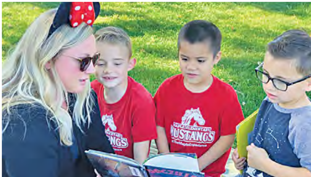
Students and families read together on the field during Maple's Book-nic!

Throughout the week, students earned tickets for extraordinary reading behaviors, and these tickets were drawn on Friday, every hour on the hour. Each hour, a ticket was drawn from each class, and the lucky winners won a free book gift certificate for the Book Fair!